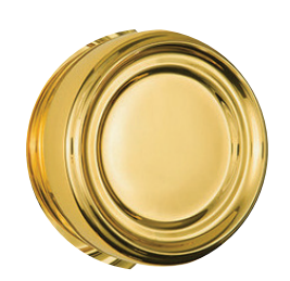
Polished Brass (105)

Images in grey boxes indicate core stocking program